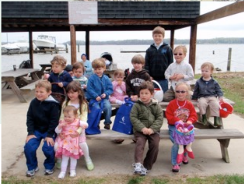
Easter Egg Hunt at our Community Beach.

Paper copies of The Barnacle, for residents who do not have the Internet, are in a box attached to the PARK sign