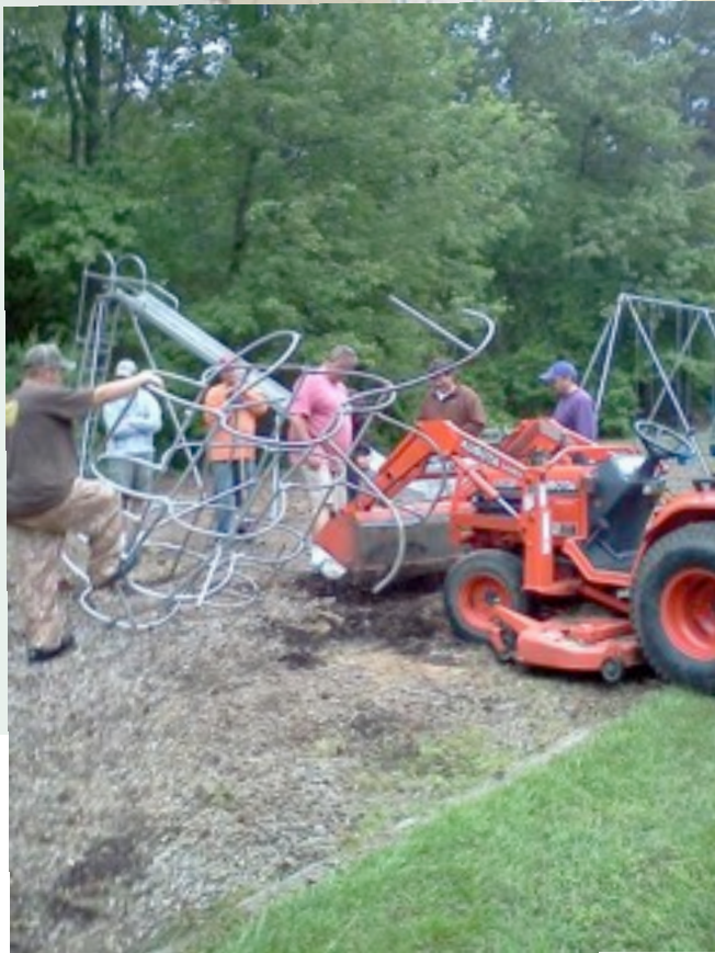
Neighbors rallying for Park Clean Up Day