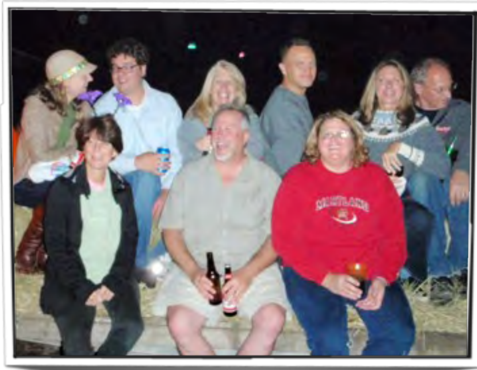
Adult Hayride: North Shore Style!