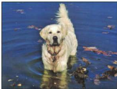
Dogs like Finnegan love to play in the water, but may be at health risk from algal toxins. Although Finnegan did eat some dark false mussels, quick veterinary attention saved his life.