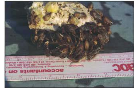
A cluster of dark false mussels that might be found growing on pilings or floats left in the water.

Harmful algal blooms (HABs) are overgrowths of algae that cause water quality problems in the Chesapeake Bay and its tributaries. Most often HABs are due to growth of blue-green algae or cyanobacteria, resulting from the flow of nutrients from fertilizers or septic systems into our creeks and rivers. Blue-green algae can produce toxins that can cause liver damage. These toxins can poison people, waterfowl or dogs. HABs often appear as a green or blue-green discoloration of the water. If such a change in color is evident, keep children and pets out of the water. Maryland residents can check for the presence of HABs by going to http://mddnr.chesapeakebay.net/eyesonthebay/habs.cfm . If you see an algal bloom, you can report it on the Fish Health Hotline, 877-224-7229. There is more information on HABs at http://www.dnr.state.md.us/bay/hab .